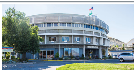
Opened May 1972