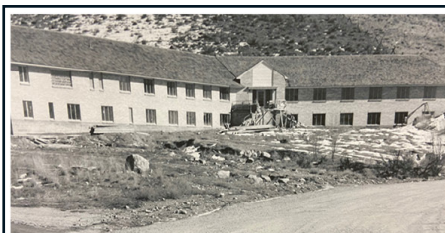
Opened August 9, 1948