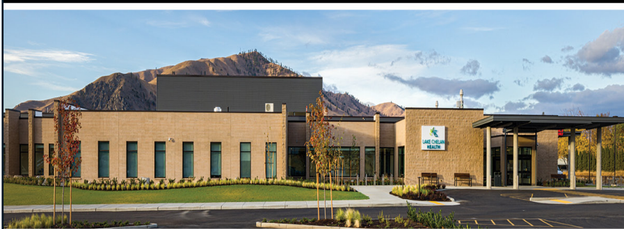
Opened December 5, 2022