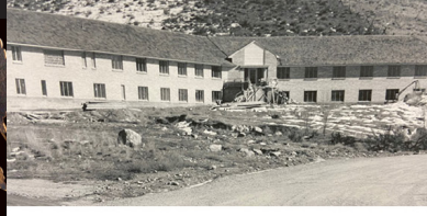
Opened August 9, 1948