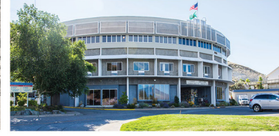
Opened May 1972