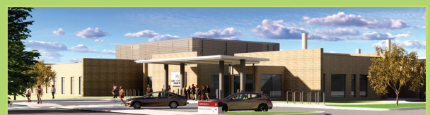
Street View Rendering of New Hospital

construction team to build and plan for the completion of the new hospital, but they are also planning for how to best use the current hospital building after moving hospital services. LCH is evaluating the consolidation of services and assets into the current building as there is an opportunity for saving money on leasing extra building space. This means that the Express Care walk-in clinic, Specialty Care services and business office may be moved into the old hospital building, but a decision has not yet been made. A lot of thought is being put into developing a Transition Plan that will best serve our community.