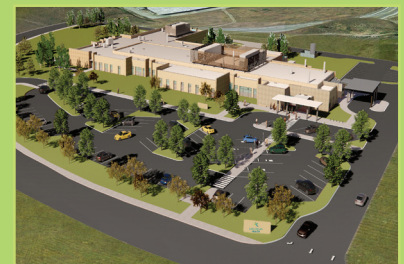
Aerial Rendering of New Hospital

There are a lot of moving parts for Lake Chelan Health. Staff members are not only working with the